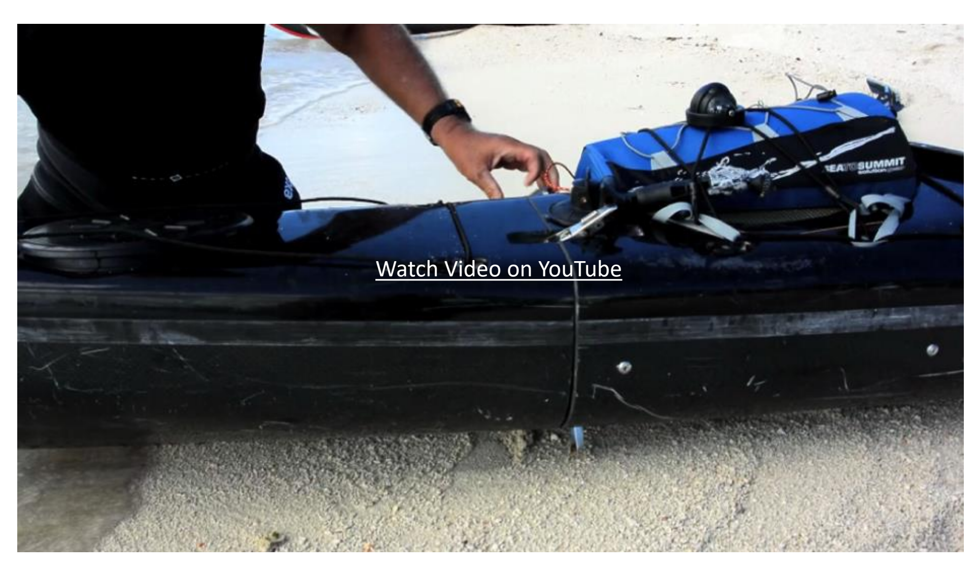
JOINING A 3pc KAYAK ONLY TAKES TWO TO THREE MINUTES